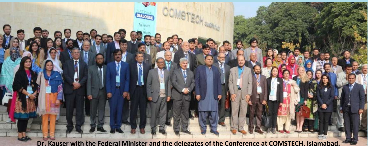
Dr. Kauser with the Federal Minister and the delegates of the Conference at COMSTECH, Islamabad.