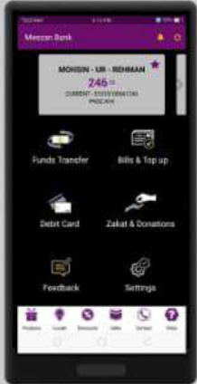
Login Mobile App