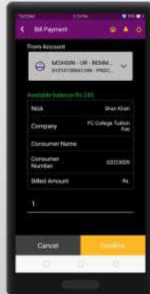
Select FC College for Payment