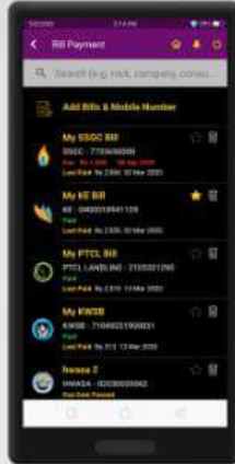
Go to Bill Payment Menu