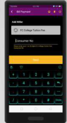
Enter Roll Number without special character "-" and Nick to add bill