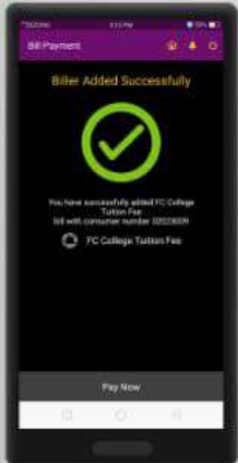
Successful addition of bill