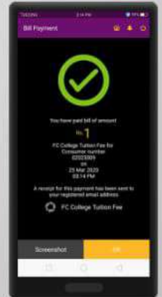
Successful payment screen