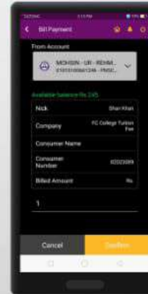
Enter amount and Confirm Payment